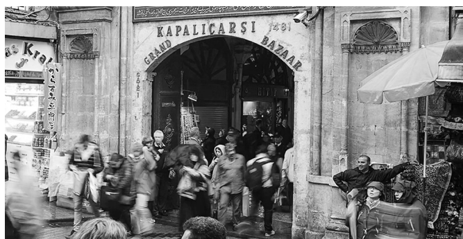
4 Grand Bazaar , Istanbul, Turkey