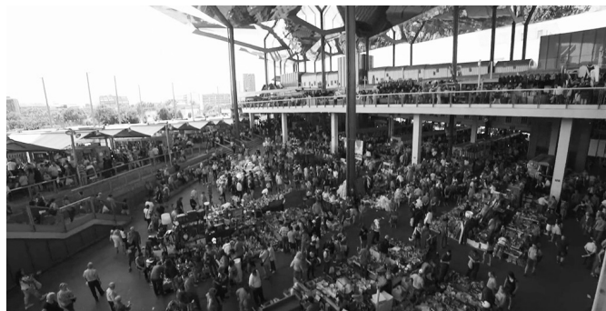
2 Ecants , Barcelona, Spain