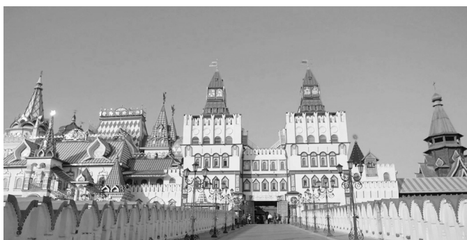
3 Izmailovsky , Moscow, Russia