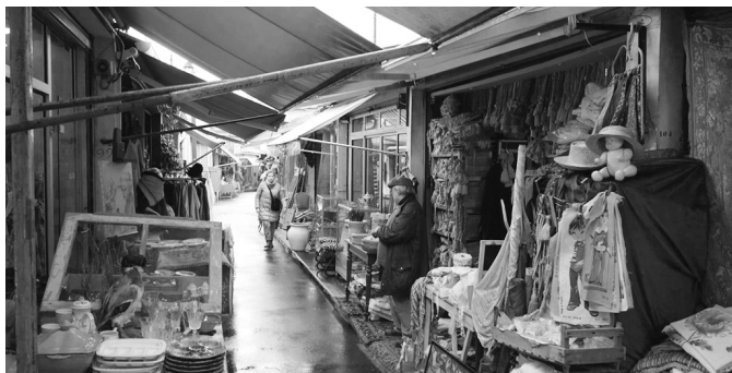
1 Les Puces , Paris, France

clothes gold computers paintings fur hats hamburgers chairs lanterns tables kebabs watches